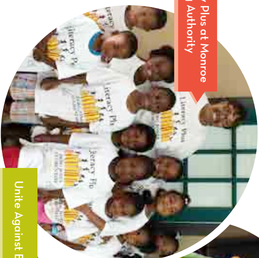
Literacy Plus at Monroe Housing Authority