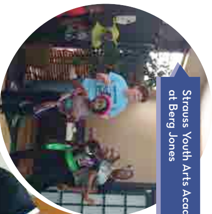
Strauss Youth Arts Academy at Berg Jones